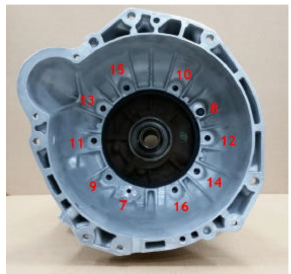
Figure 6 – Bellhousing torque sequence