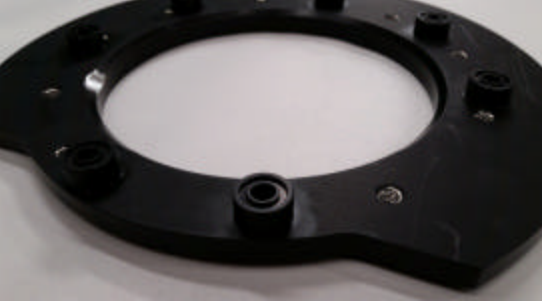
Figure 2 – Adapter back o-ring counter bores