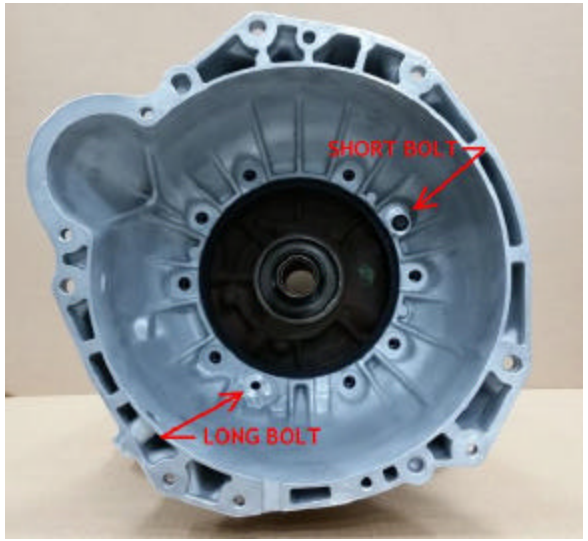
Figure 5 – RB bellhousing installed